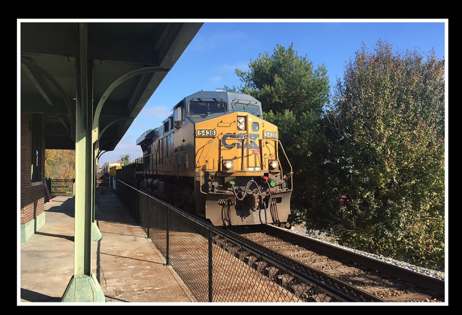
West Kentucky NRHS Chapter Photo Contest Second Place, November 2017

West Kentucky NRHS Chapter Photo Contest - A southbound CSX local passes the former L&N Madisonville KY Passenger Station during the new "Innovation Station" dedication ceremony November 16, 2017.